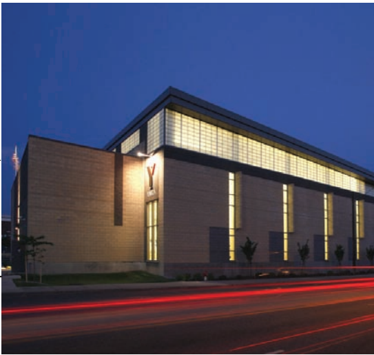
Architect: ALSC Architects Mason Contractor: Spilker Masonry Structural Engineer: Coffman Engineers