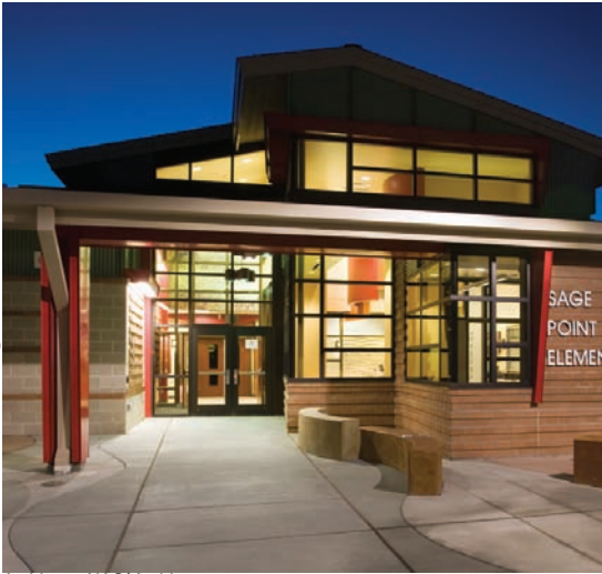
Architect: NAC|Architecture Mason Contractor: Great Northern Masonry Structural Engineer: Structural Design Northwest