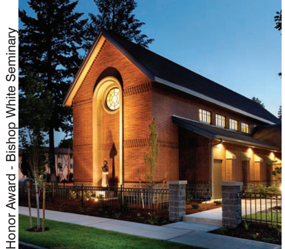
Honor Award - Bishop White Seminary