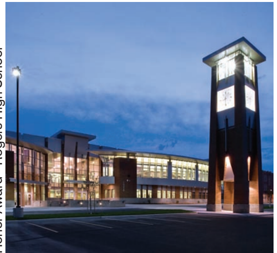
Honor Award - Rogers High School

Architect: Madson, Mitchell, Evenson & Conrad Mason Contractor: Great Northern Masonry Structural Engineer: Structural Forte