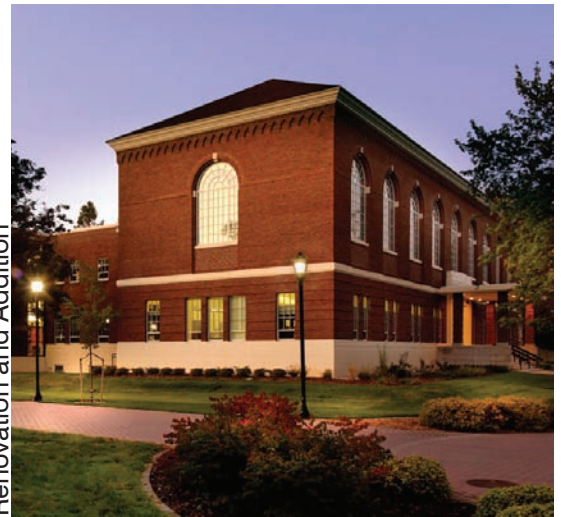
Merit Award - Hargreaves Hall Renovation and Addition

Architect: Architects West Mason Contractor: Dempsey Masonry Structural Engineer: DCI Engineers