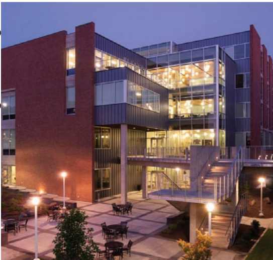
Architect: Integrus Architecture Mason Contractor: Spilker Masonry Structural Engineer: Integrus Architecture