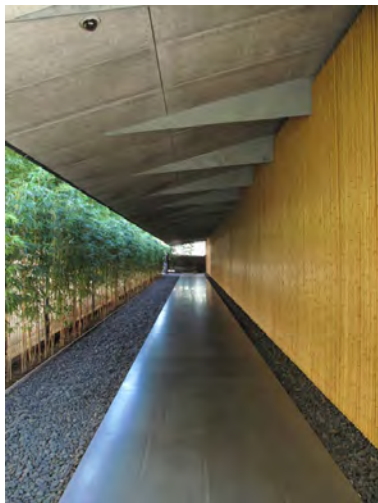
Some beautiful Architecture by Kengo Kuma

February 2012 Northwest and Pacific Region AIA Updates: