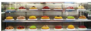
Some very good food

After completing our third leadership institute in October, hosted by the University of Washington, plans are moving forward to expand the institute for 2012 to include schools from the Western Mountain Region. We have had an initial planning meeting and a committee has been formed from educators from both regions' schools of architecture. We hope to have in the range of fifty students from both regions attending the leadership institute and conference in Tucson, so this will add a great dynamic to the conference.