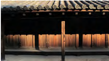
Imperial Palace: Tokyo, Japan November 2011