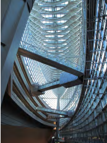
Tokyo convention Center